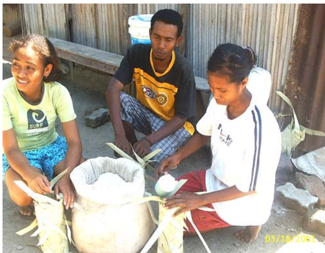
Kay Rala students prepare salt for their family business in Manatuto. Salt is sold in liter-sized woven palm baskets, seen in front.

Students at Nova and SETRA members are investigating the possibility of importing sea salt from Manatuto to distribute in Seattle. The local salt we brought home is excellent in flavor and texture, and salt is becoming an essential gourmet item for discriminating cooks in the Northwest as well as the rest of the USA. Like other SETRA projects, we aim to "give to the community twice". Exporting the salt will increase the economic opportunities for the family producers in Manatuto, and the profit from the sales here will continue to support our current projects, HIAM Health, and Kay Rala Secundaria. We hope to arrange for a small shipment soon so we can have samples for potential buyers to taste. If you would be interested in purchasing this excellent sea salt, in any quantity, please call us at 206-523-3656 or 206-523-3278.